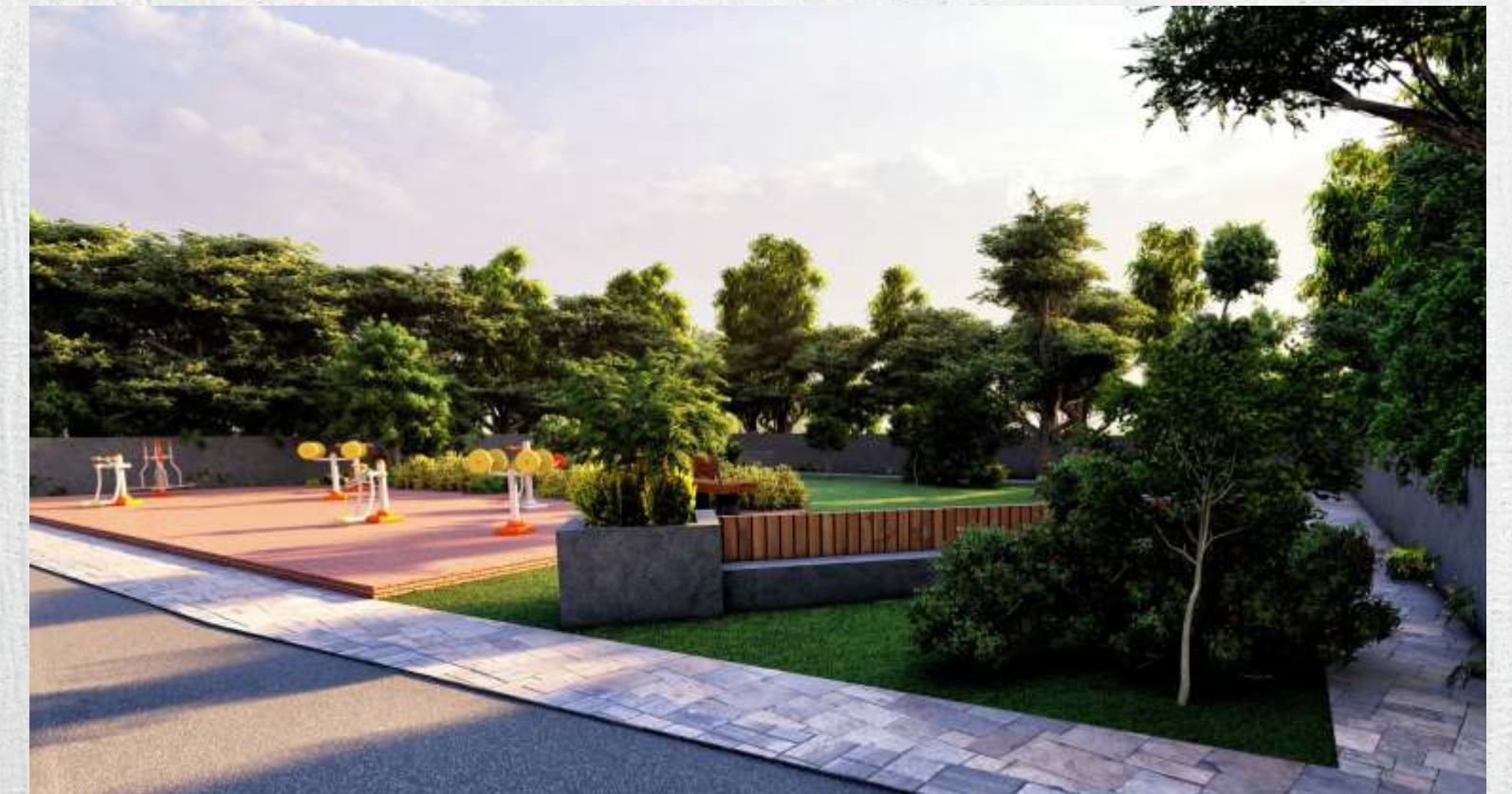
OPEN AIR GYM & WALKING TRACK

Meticulously planned and designed to provide the right lifestyle for those planning their dream home or investing in a property, Nakshatra Bollineni County is BMRDA approved, with well-demarcated plot layouts ranging in varying sizes.