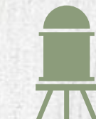
Over Head Tank